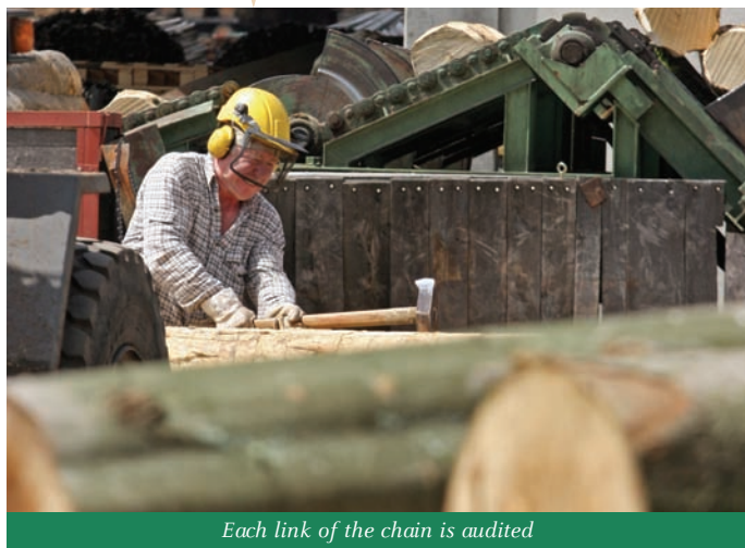
Each link of the chain is audited