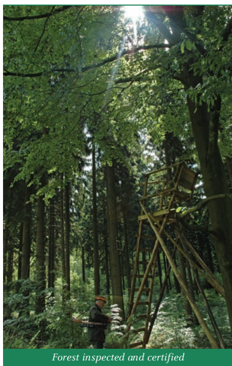
Forest inspected and certified

Every year an area half the size of the UK is cleared of natural forests: temperate and tropical, North and South and on every continent. These forests, which once covered half of the planet, are irreplaceable and their loss has profound economic, social and environmental impacts. Forests support up to 1.6 billion of the poorest people in the world, and 60