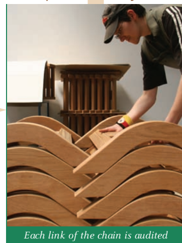
Each link of the chain is audited

In addition to forest certification, the FSC system includes a certified chain of custody that tracks the timber through every stage in the supply chain from the forest to the final user. This is monitored through the invoicing process and the final label on the product has a code that confirms that the item is genuinely FSC.