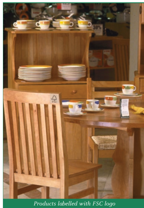
Products labelled with FSC logo

Forests must be managed to the highest environmental, social and economic standards. Trees that are harvested are replanted or allowed to regenerate naturally but it does not stop there. The forests must be managed with due respect for the environment, the wildlife and the people who live and work in them. This is what makes the FSC system unique and ensures that a forest is well-managed, from the protection of indigenous people's rights to the methods of felling trees.